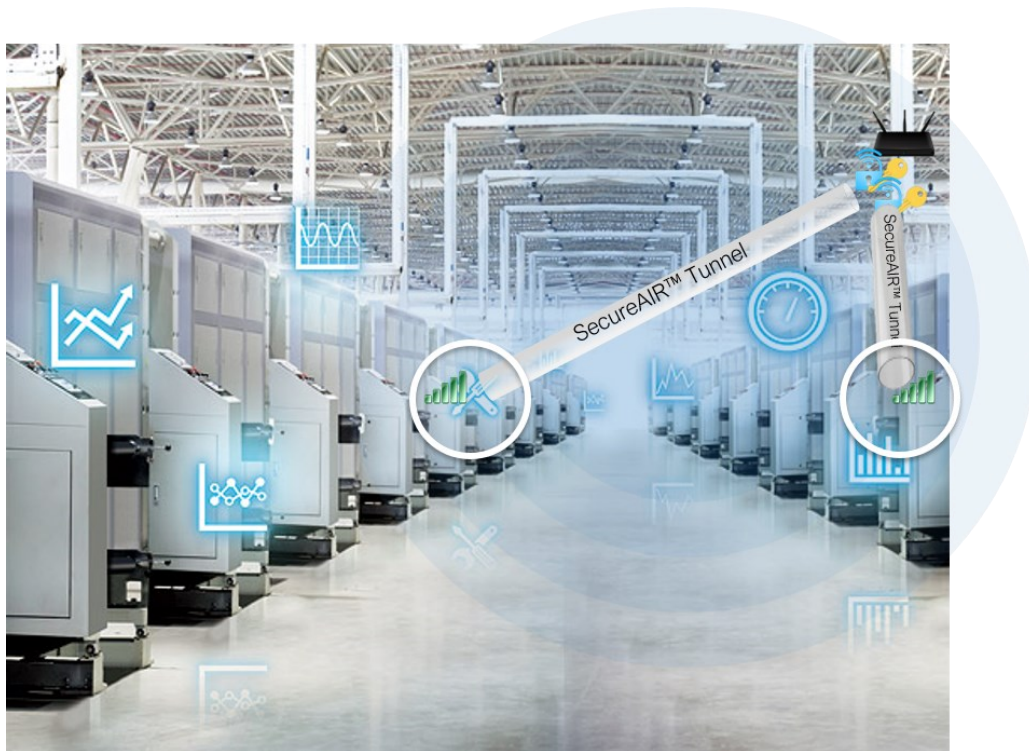
Celeno's SecureAIR™ physical layer technology

Celeno addresses this challenge with SecureAIR™ - a novel and patented physical layer security embedded within our Wi-Fi chipsets. SecureAIR leverages real-time signal processing techniques to transmit a focused signal together with surrounding shielding beams, which constructs a dynamic virtual electromagnetic shield surrounding the RF communication between access points and legitimate client devices, preventing interception of the Wi-Fi signal.